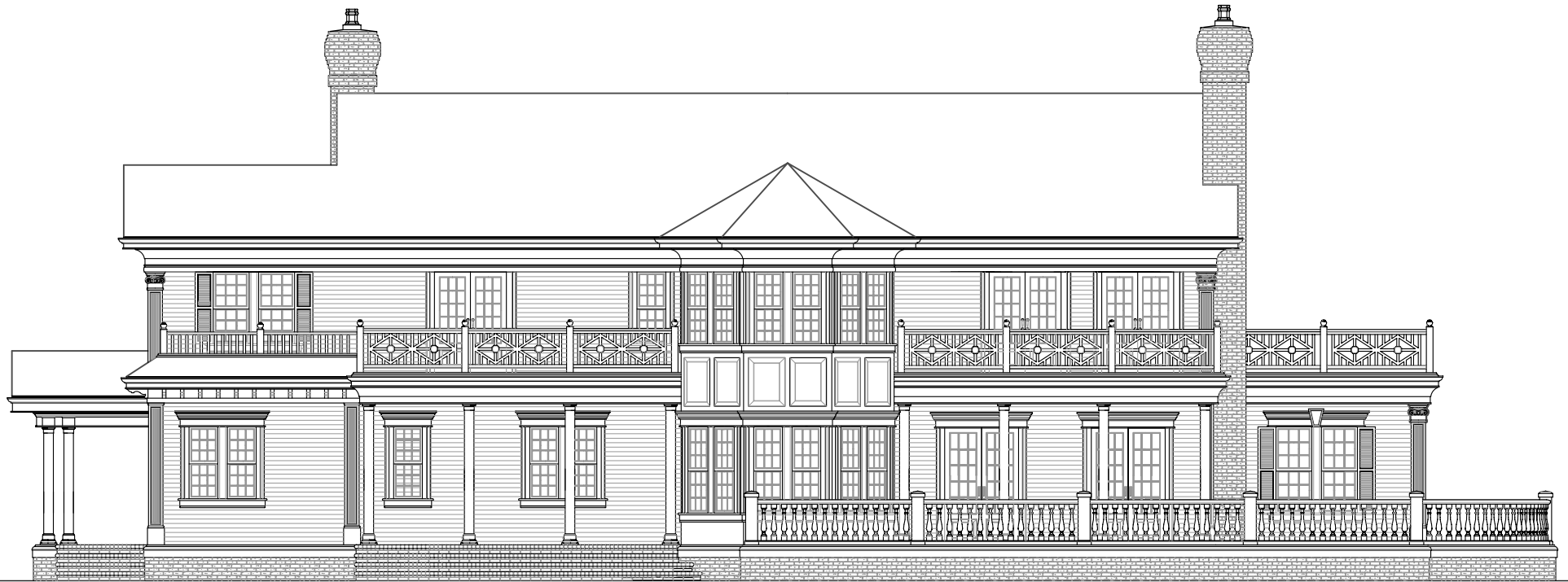
THE WELLSLEY, REAR ELEVATION