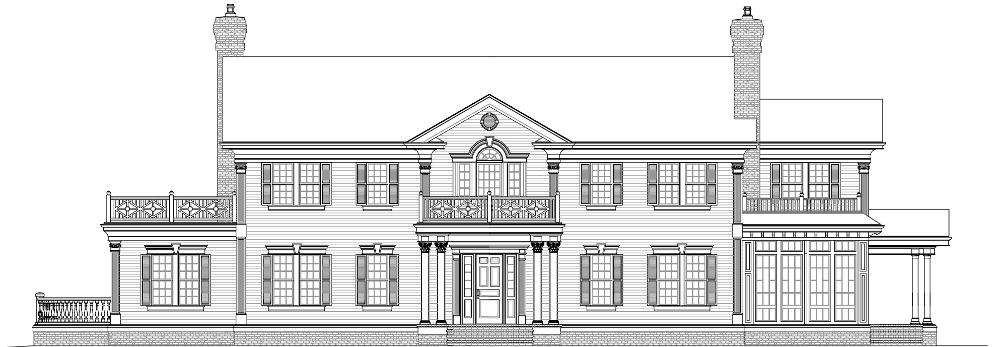
THE WELLSLEY, FRONT ELEVATION