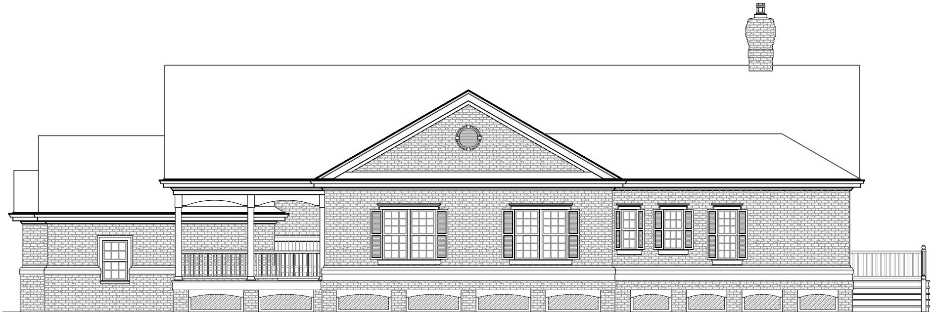
THE TOWSON, RIGHT ELEVATION, FACING