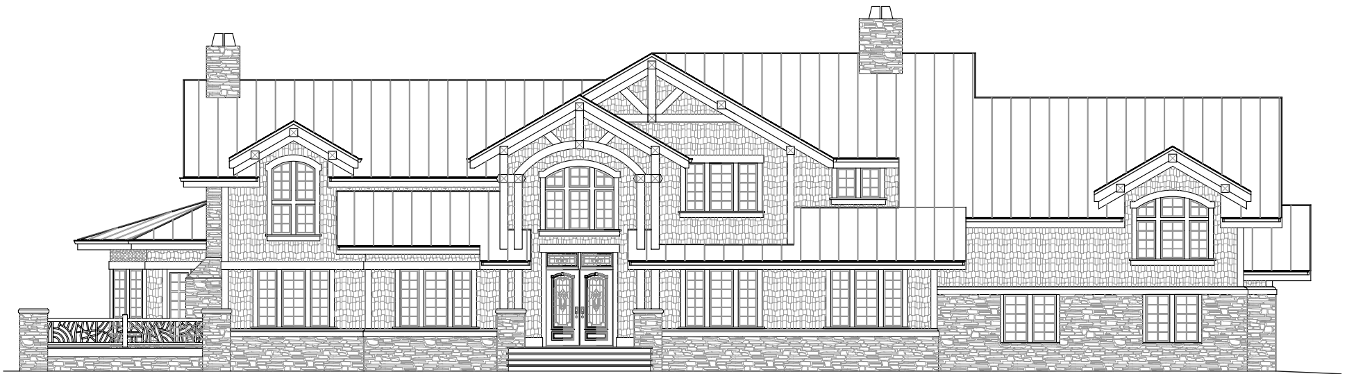
TAHOE PINES, FRONT ELEVATION