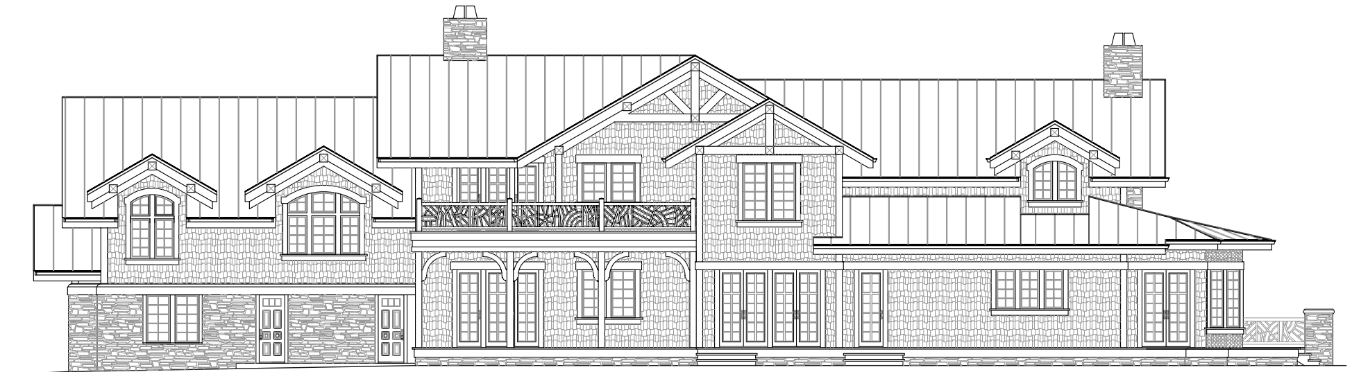
TAHOE PINES, REAR ELEVATION