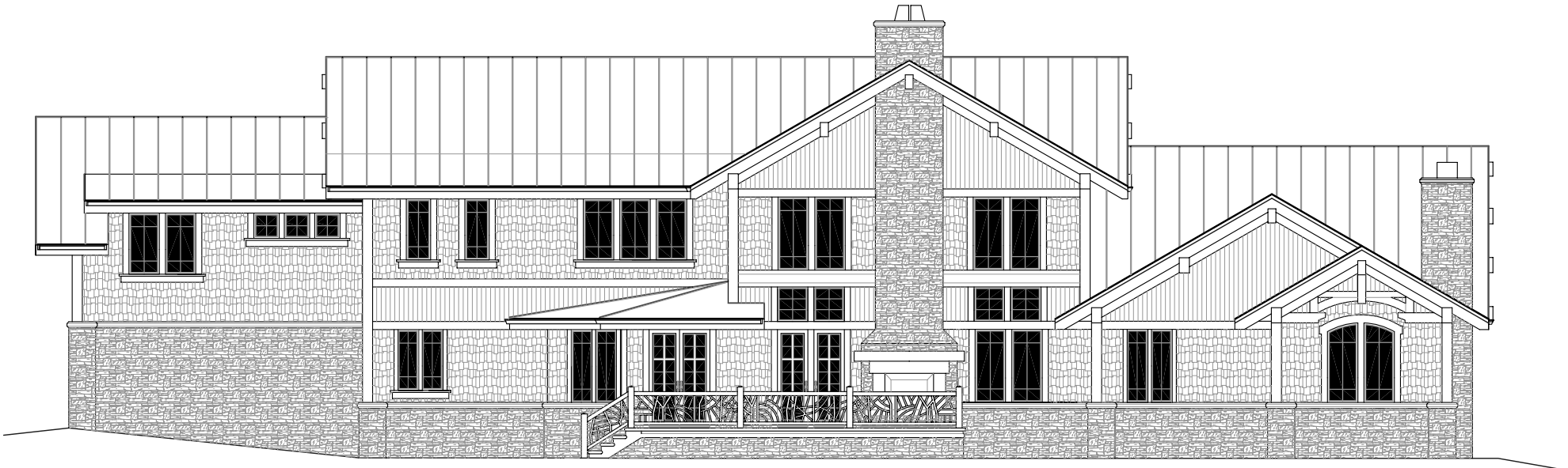
TAHOE CEDARS, REAR ELEVATION