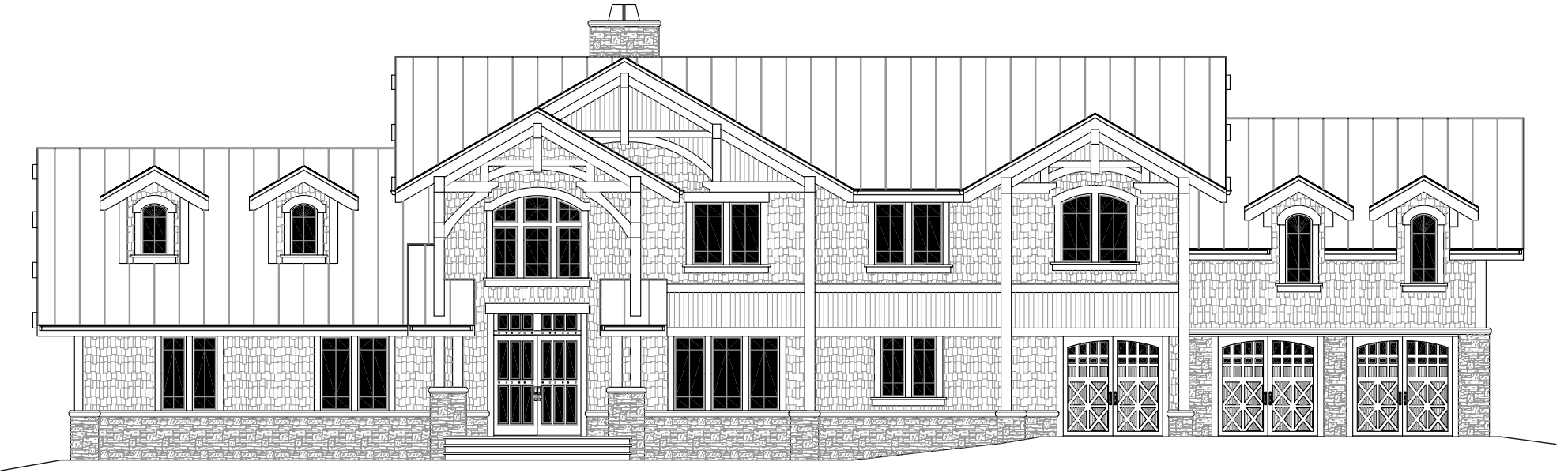
TAHOE CEDARS, FRONT ELEVATION