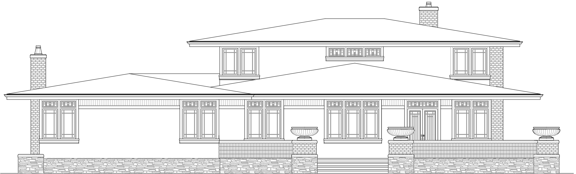
NORRINGTON, LEFT ELEVATION, FACING