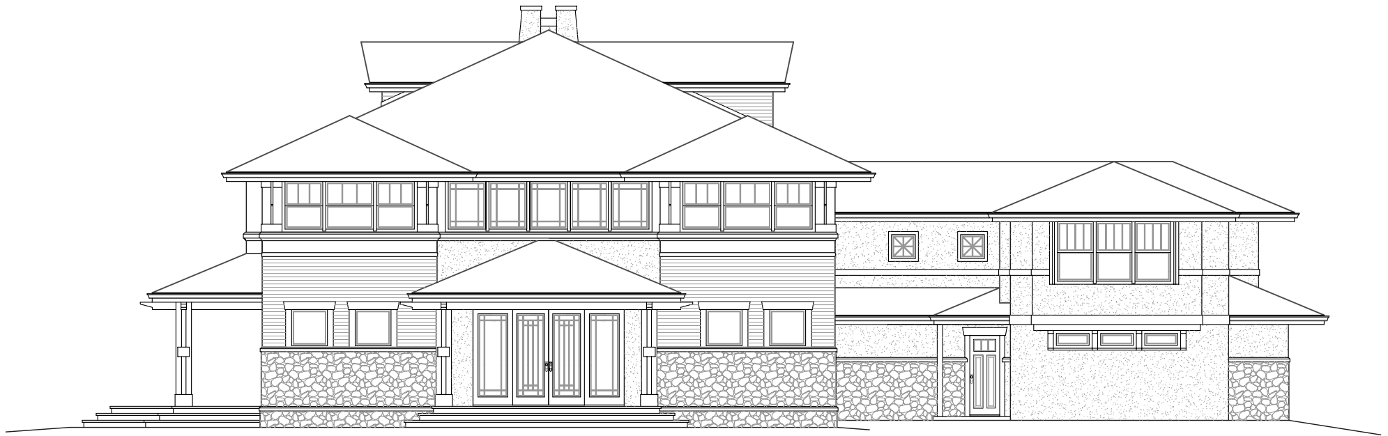
MADISON 1 - REAR ELEVATION