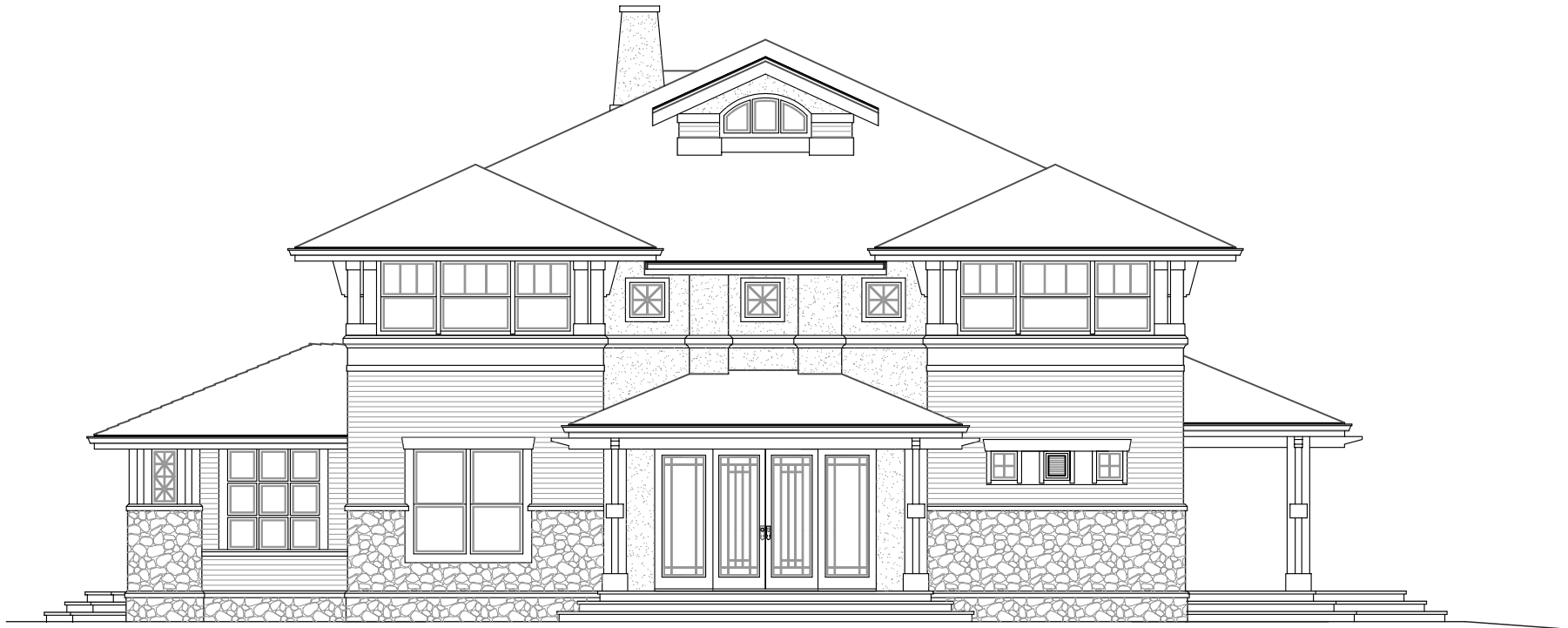
MADISON 1 - RIGHT ELEVATION, FACING