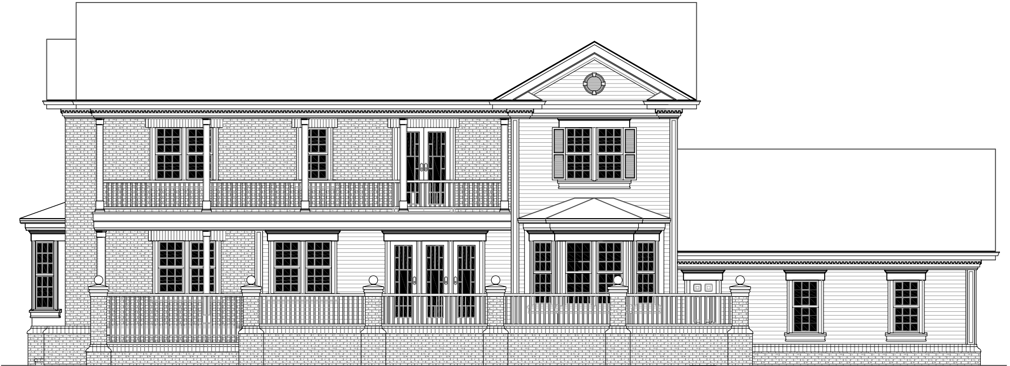
MABRY COURT, RIGHT ELEVATION, FACING