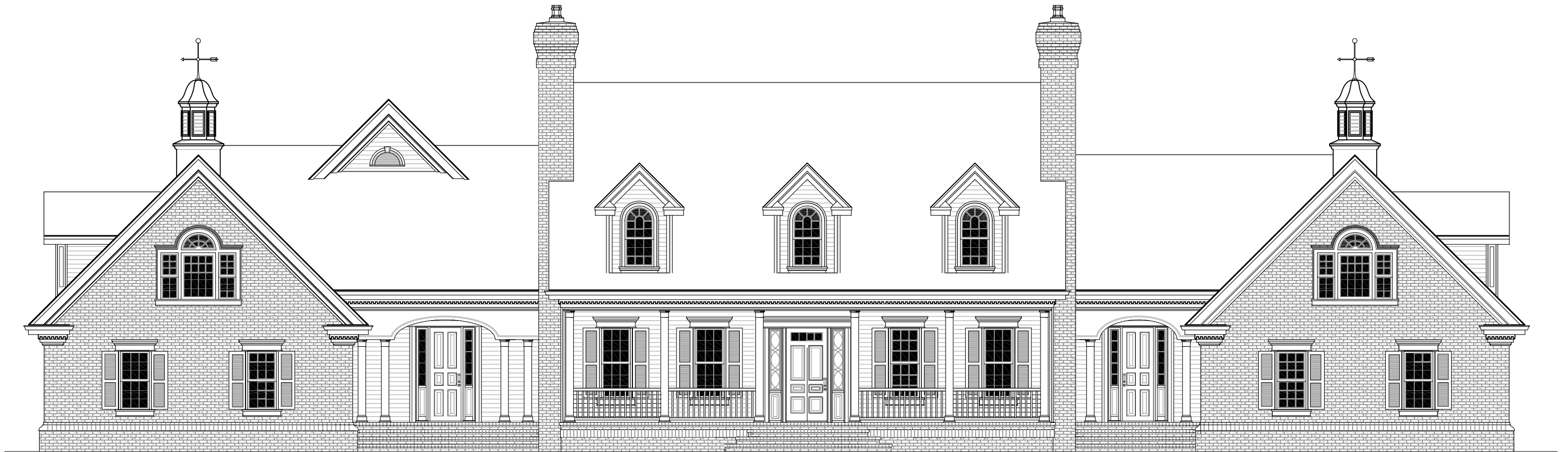
KENSINGTON REACH, FRONT ELEVATION