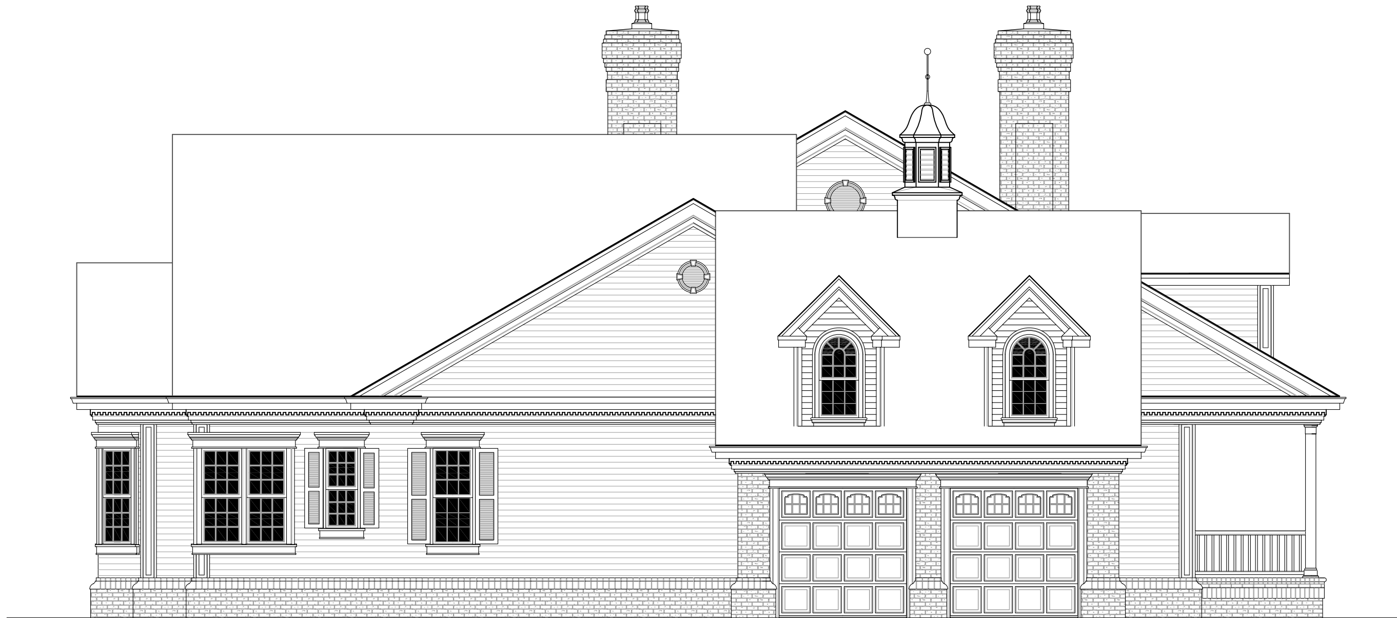
KENSINGTON REACH, LEFT ELEVATION, FACING