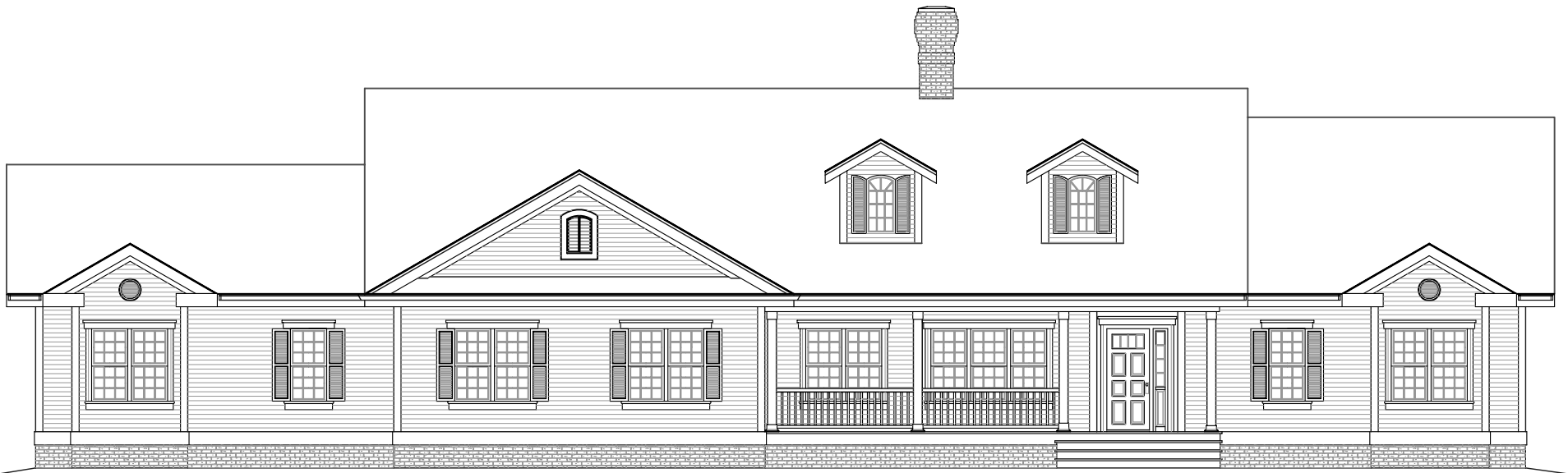
FREMONT, FRONT ELEVATION