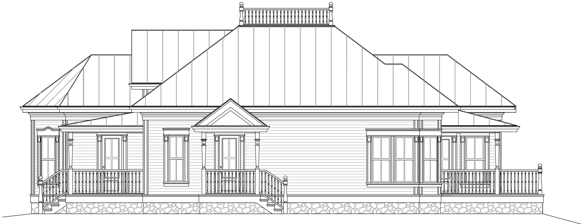
THE DAPHNE, LEFT ELEVATION, FACING