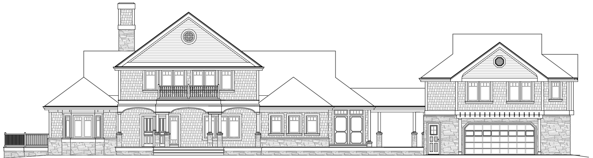
CHELAN 1, REAR ELEVATION