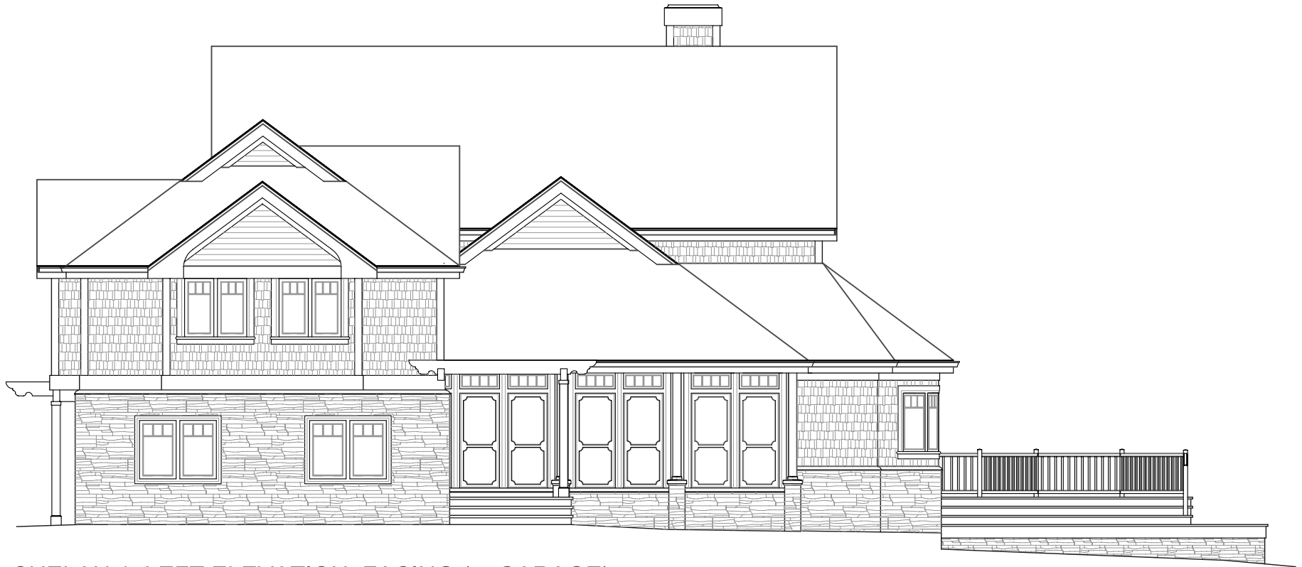
CHELAN 1, LEFT ELEVATION, FACING (at GARAGE)