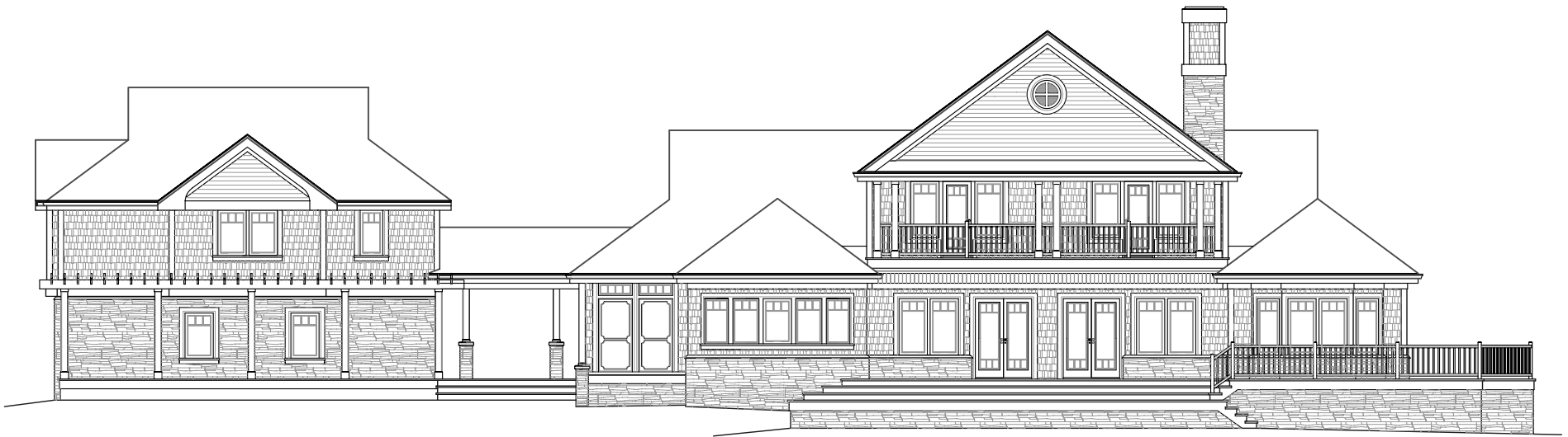
CHELAN 1, FRONT ELEVATION