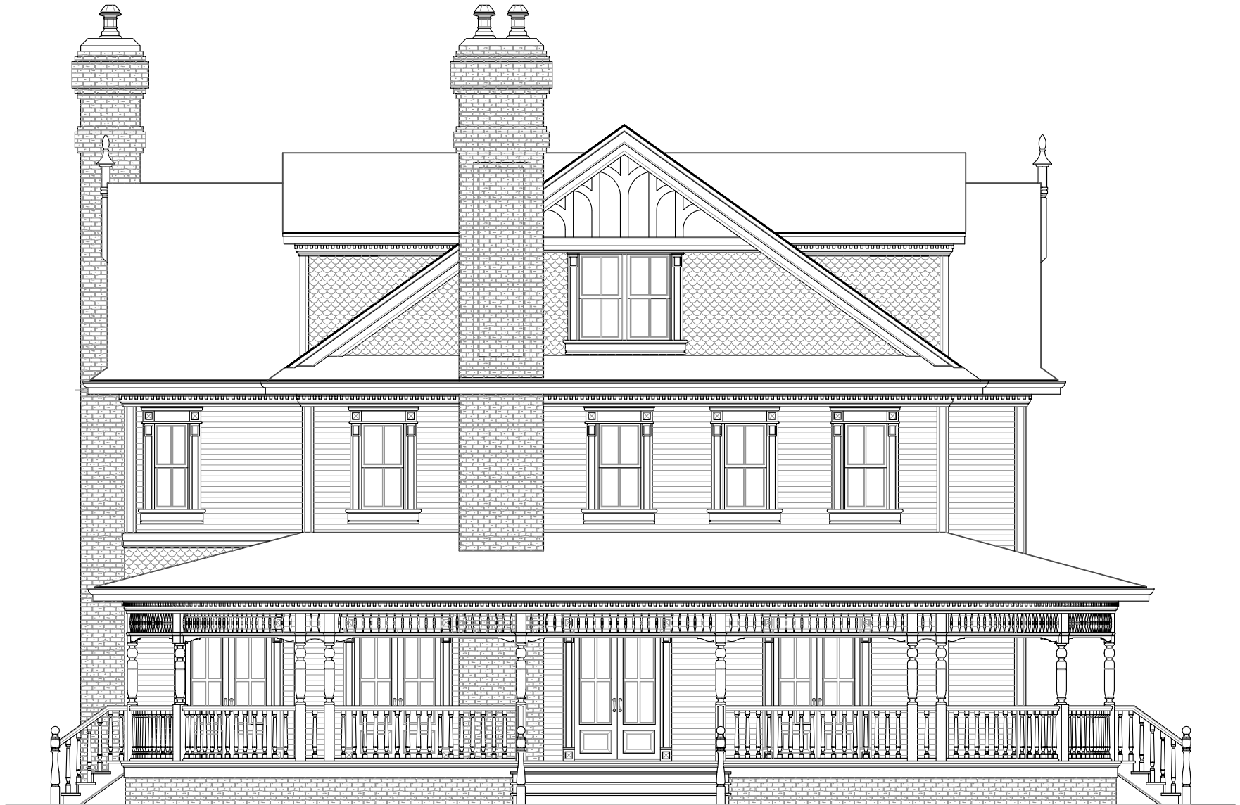
THE ADELAIDE, LEFT ELEVATION, FACING