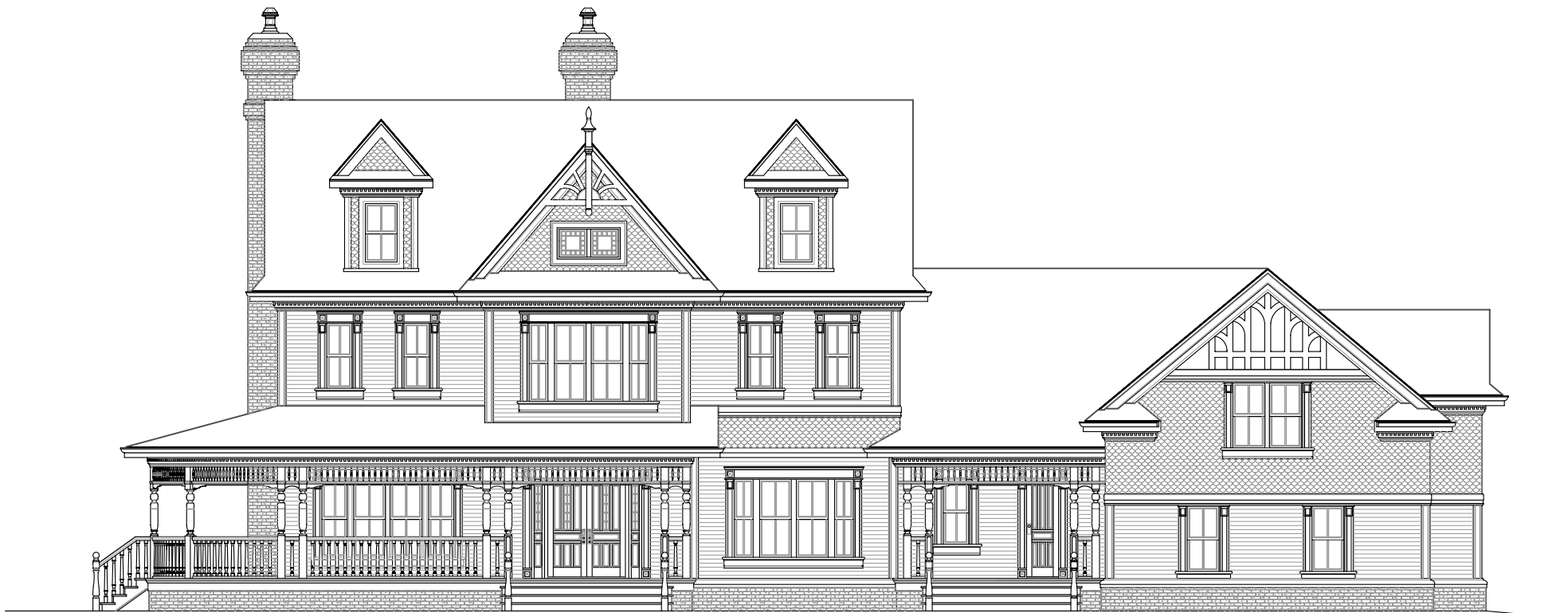
THE ADELAIDE, FRONT ELEVATION